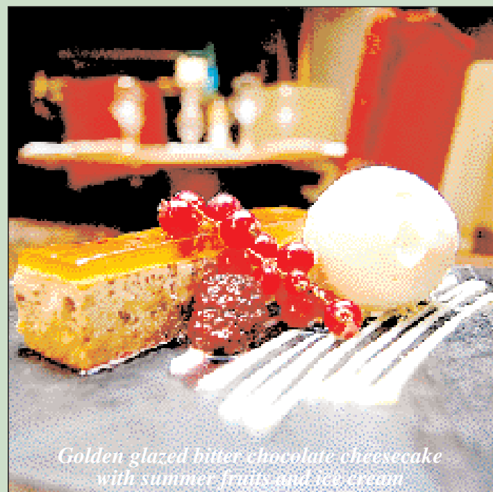
Golden glazed bitter chocolate cheesecake with summer fruits and ice cream